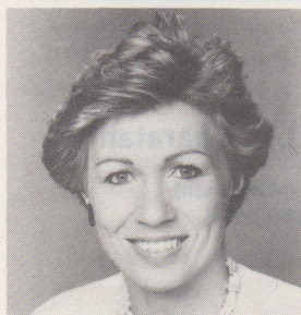
Barbara Corcoran President The Corcoran Group (Manhattan) Residential brokerage/marketing